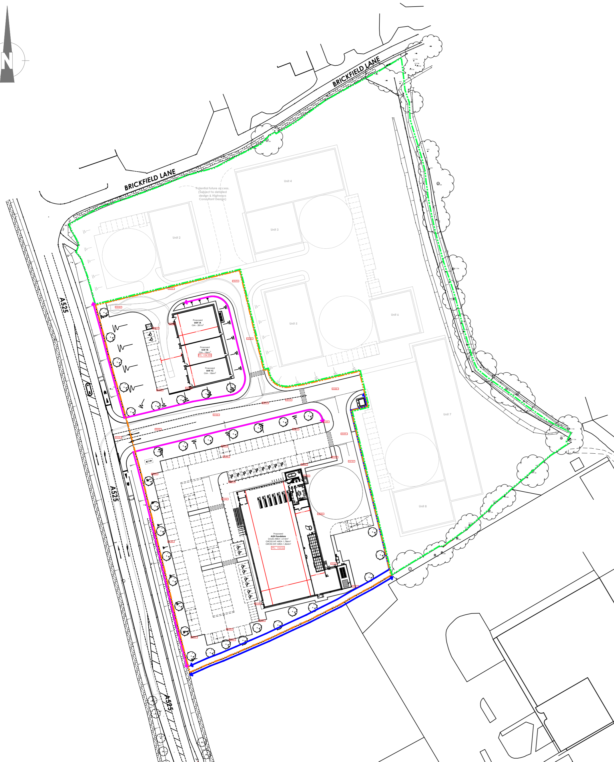
Proposed Boundary Treatment Plan - Scale 1:500